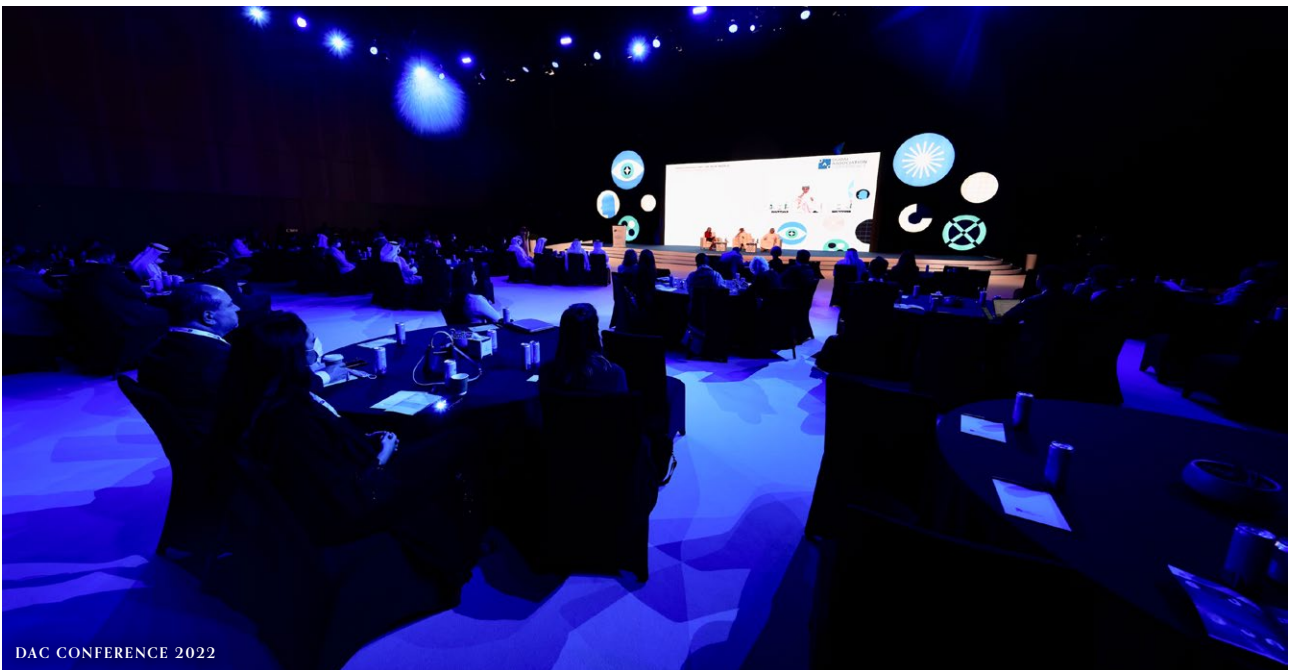
DAC CONFERENCE 2022

Dubai's biennial gathering has solidified its place as a key event within the association community. With the upcoming edition featuring crucial themes like artificial intelligence and strategies for managing disruptions, it is poised to be more pertinent and influential than ever before.